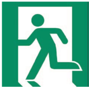
Diagram 3 - Running Man Exit (Left)