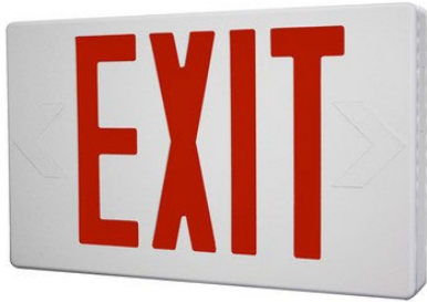
Diagram 1 - Exit Sign

NOTE: Please contact the local Authority Having Jurisdiction for any questions regarding this Safety Tip.