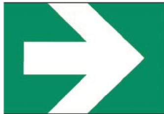
Diagram 4 - Exit Arrow Indicator