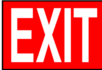
Diagram 2 - Exit Sign