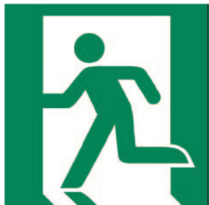
Diagram 3 - Running Man Exit (Left)