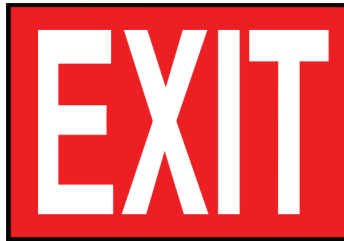
Diagram 2 - Exit Sign