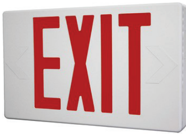
Diagram 1 - Exit Sign

It is an NFC(AE) requirement to keep a record of all inspection and maintenance requirements for exit signs. The records must be kept on the premises for five years from the time the inspection and maintenance was completed.