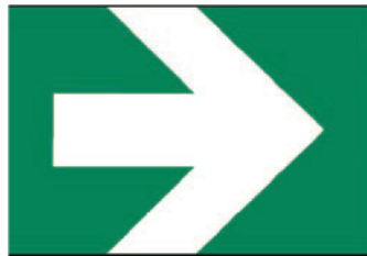
Diagram 4 - Exit Arrow Indicator